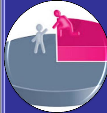
Block 4 Increase Performance & retention