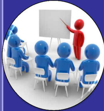
Block 3 Workforce Development