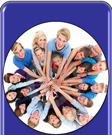
Block 1 Engaged Stakeholders