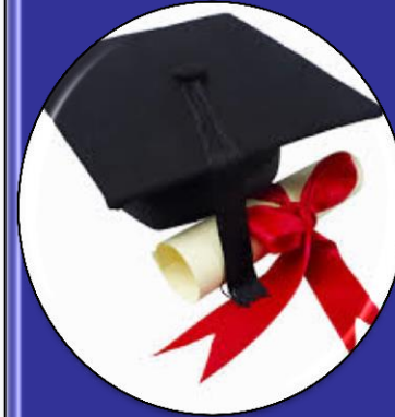
Block 5 Professionalisation of SCM