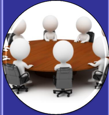
Block 2 Optimise Policies & Plans