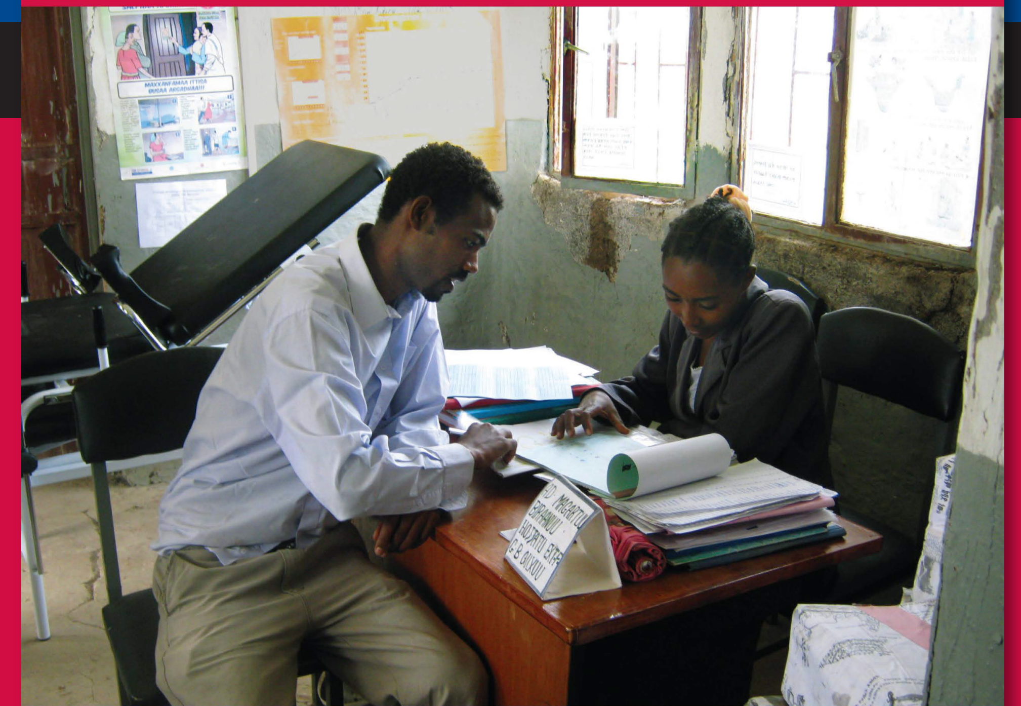
June 2013 This publication was produced for review by the U.S. Agency for International Development. It was prepared by the USAID | DELIVER PROJECT, Task Order 4.