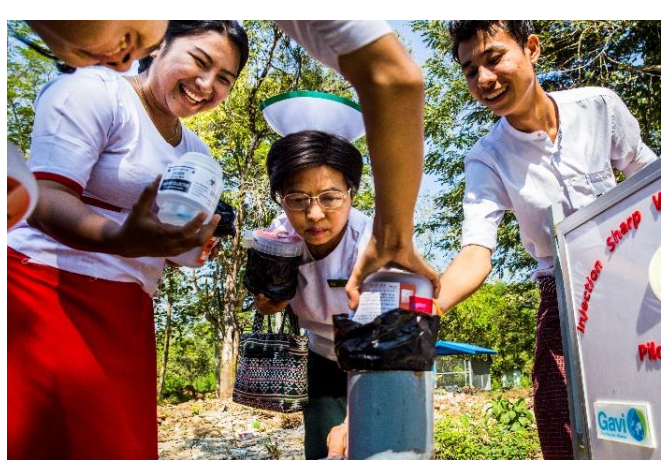
Health staff practice disposing collected needles into the sharps pit.

document experiences of basic health staff in using needle cutters, needle pits, and storage units in order to support the rollout of the health care waste management system in target townships. Based on the monitoring visits, all health facilities are currently using needle cutters and adhering to the health care waste management system in the two townships.