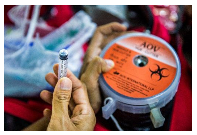
A needle cutter separates sharps and syringes in a safe way.

syringe, thereby separating the needle from the syringe body. This allows for isolation of potentially infectious sharps and their disposal in protected sharps pits. The plastic syringe can then be disinfected and recycled in an environmentally friendly and sustainable manner. The disabled syringe also prevents improper reuse of injection equipment.