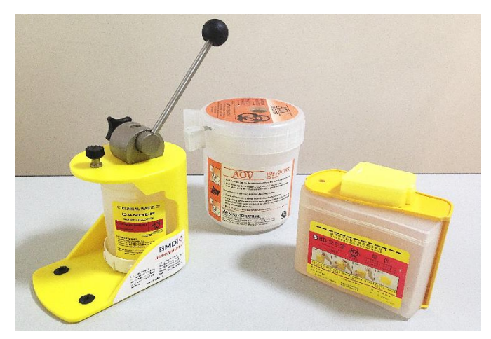
Examples of different designs of needle cutters.

analysis of available needle disabling and disposal technologies, plastic recycling businesses, and needle pit designs in Myanmar. PATH also involved itself at the policy level by developing standard operating procedures (SOP) for sharps waste management and setting up a national technical working group and township steering committees for government and public-sector stewardship.