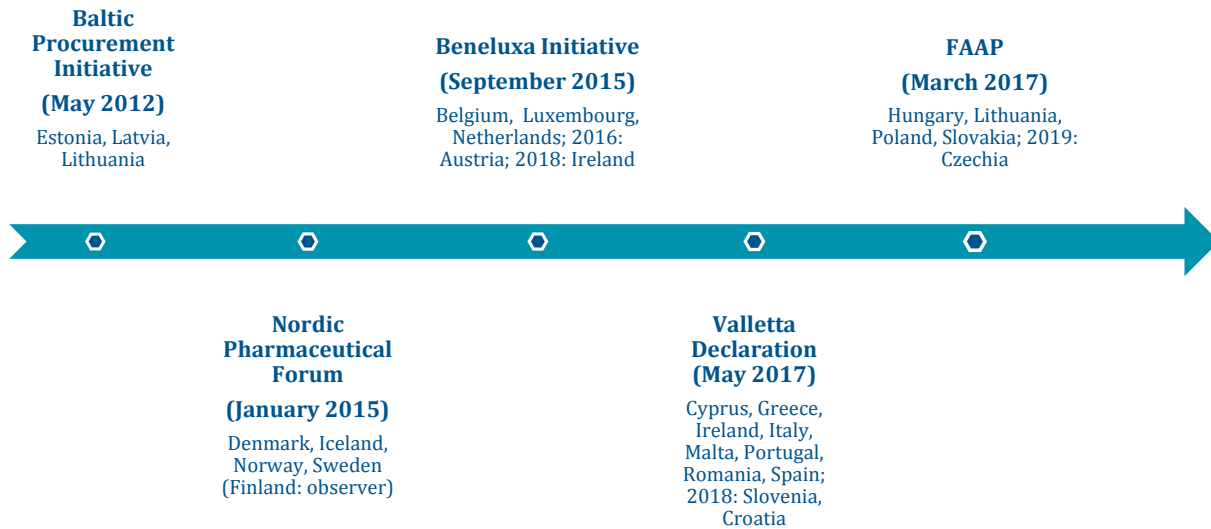
Fig. 3.1. | Timeline of collaboration inceptions

Ireland and Lithuania joined more than one collaboration. Croatia and Slovenia moved from one collaboration (FAAP) to another (Valletta Declaration). Of the 24 countries participating in the collaborations, 22 are EU Member States, with the remaining two (Iceland and Norway) in the European Economic Area (EEA) (Fig. 3.2). Countries in collaborations tend to be either in the same geographical region (as with the Baltic Procurement Initiative) and/or of similar socioeconomic backgrounds (as with FAAP and the Beneluxa Initiative, which consist of high-income countries of medium size).