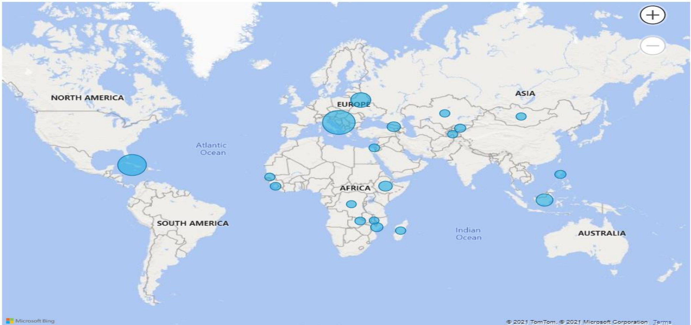
Receiving Country map in 2021