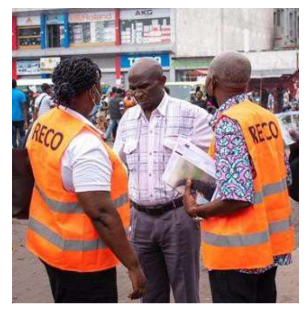
CHWs conducting sensitization in the area around a Vaccinodrome in Kinshasa Province, Democratic Republic of Congo