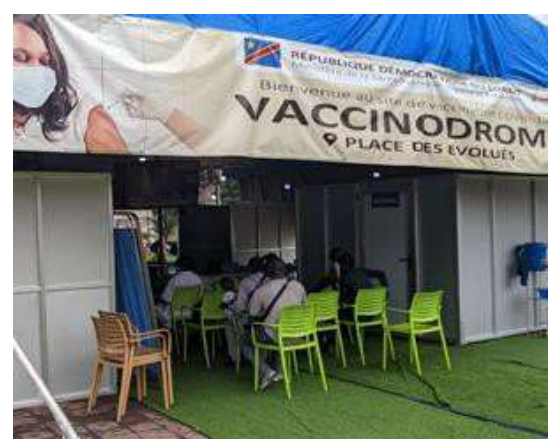
Outside the Vaccinodrome at Place des Evolues, Kinshasa, Democratic Republic of Congo